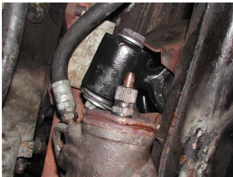
And here is the input shaft on the back of the steering box showing its master spline. The nicely painted assembly above it is the inner end of the upper suspension arm.