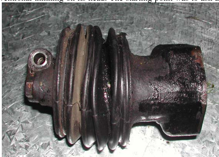
A familiar sight to those who have lain under their cars, it is the Detroit joint between the upper and lower steering columns. The concertina rubber boots by now are all rotten and split as this one is. Removal of the joint is straight forward, the clamping end on the left above is master splines and a clear scratch on the other end should ensure that when you put it back with a new boot the steering wheel will not be upside down!

Another benefit is that rear passengers are afforded a degree of privacy without having to resort to darkened windows or curtains. Each C-post contains a paneled quarter mirror, which from within appears to be a continuation of the side window. And when both front and rear doors are open they form a protective barrier around a passenger entering or leaving the car. Despite the obvious safety benefits, before the coach doors could be adopted many legislative obstacles had to be overcome. Rolls-Royce is the only motor manufacturer in the world to be allowed to build a car with independently opening coach doors.